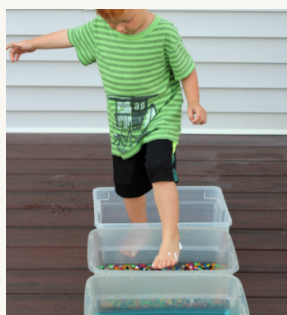
SENSORY WALK exploring the sense of touch